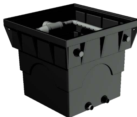
GWS10 Filtration Tank

The water that exits in the filtration tank is classified as having undergone "Primary Treatment" and must be distributed into trenches as specified by your engineer. Make sure their size calculation does not include an allowance for toilet water, which would make the trenches unnecessarily large and expensive